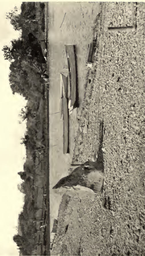
SITE OF PHILIP'S VILLAGE, NEAR MOUNT HOPE, RHODE ISLAND